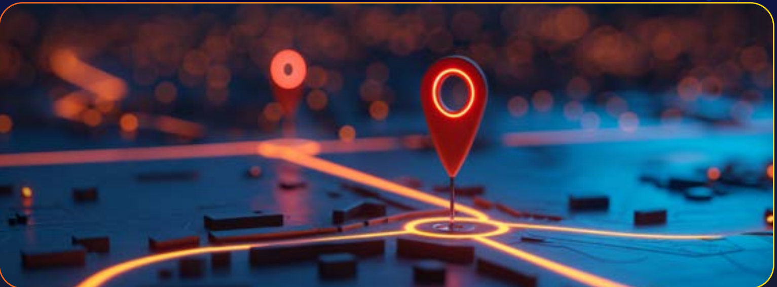
Chart a course through the stars with our detailed roadmap, guiding us towards the realization of our dreams and the fulfillment of our mission.